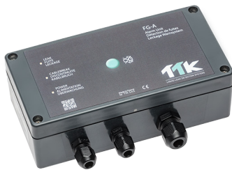
FG-A Wall Mounted Unit